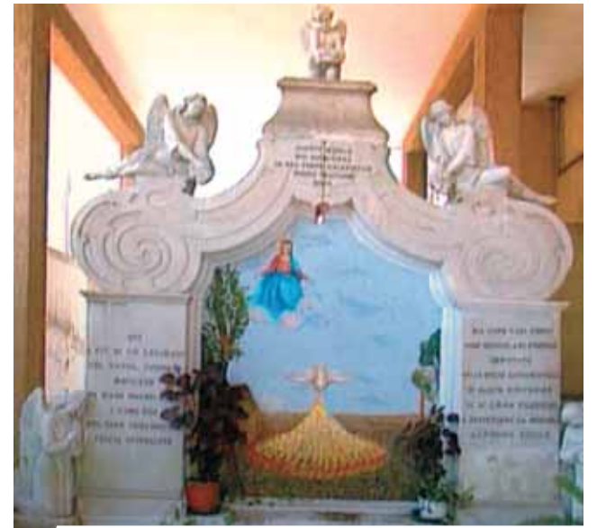
A plaque at the place where the Hosts were found