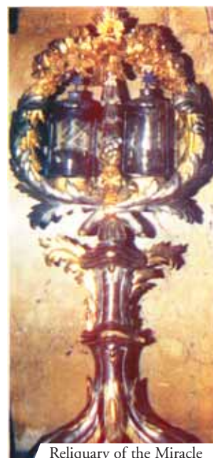
Reliquary of the Miracle