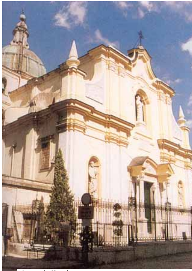
St. Peter's Church, Patierno

In 1971 the Eucharistic Year of the diocese has been established in order to allow the community to capture the essence of the Eucharistic miracle. Unfortunately in 1978 some unknown thieves were able to even steal the relic with the miraculous Hosts of 1772.