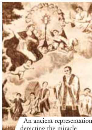
An ancient representation depicting the miracle