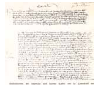
Document regarding the reception of the Holy Chalice in the Cathedral of Valencia in 1437