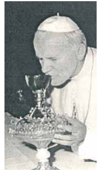
John Paul II kisses the Holy Grail of Valencia