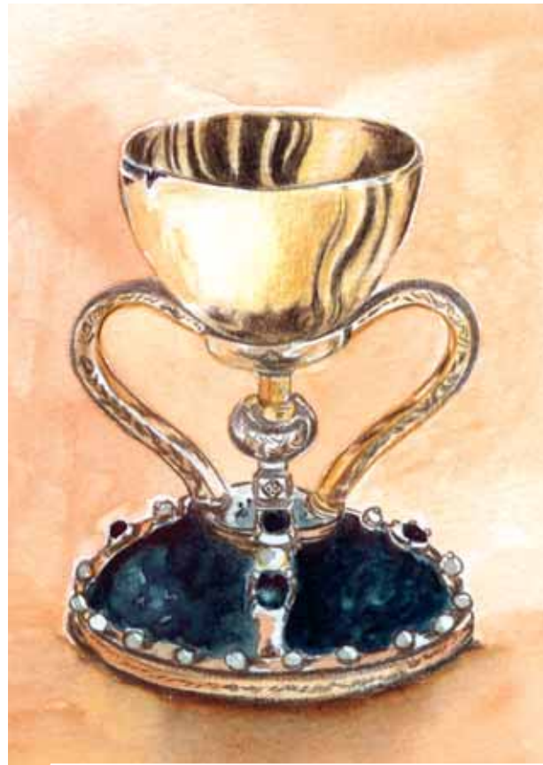
The Holy Chalice of Valencia

This precious object has always been at the center of fantastic stories and novels like the legend of the Knights of the Round Table in England, the stories of Perceval in France and Parzival in Germany of the Twelfth - Thirteenth century. This genre was used by Wagner in a Christian-esoteric perspective and at the end of the twentieth century the fantastic novels of B. Cornwell favored the birth of the editorial trend still alive today.