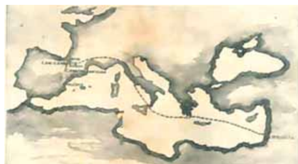
Route traveled by the Holy Chalice